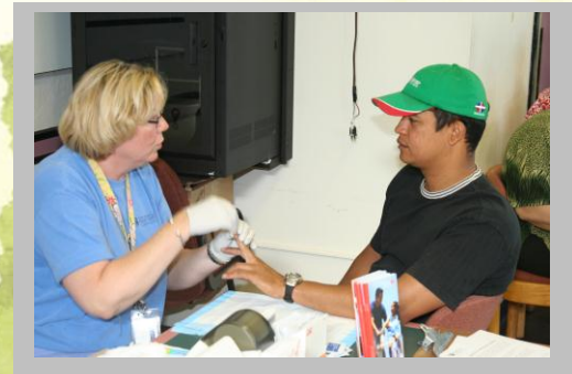
Important numbers that we should know cholesterol & Glucose